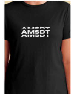
Design #4: Black, AMSDT