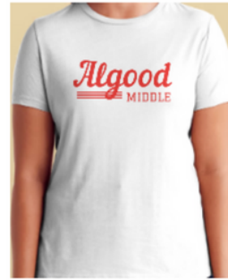
Design #1: White, rectangle Algood Middle