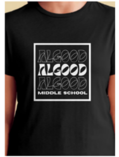
Design #3: Black, box, Algood Middle School