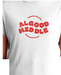
Design #2: White, circle Algood Middle